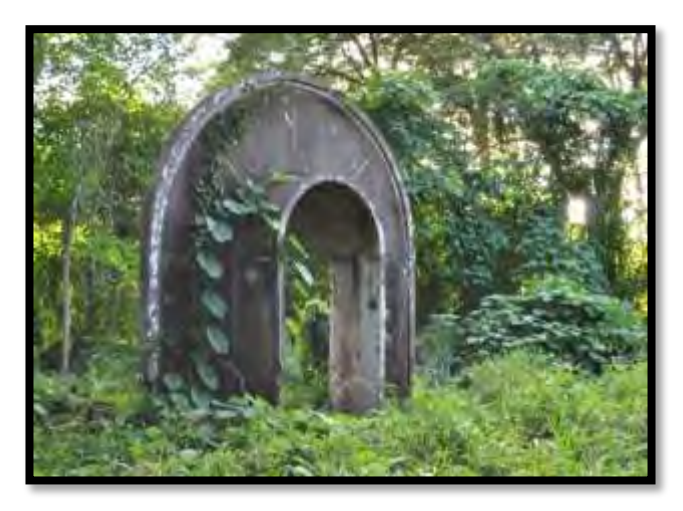
Photo 3.8-10. Remains of the Japanese Village – Last Used as an Internment Camp for Japanese during World War II

North of the Shinto Shrine is a large traffic circle on Broadway Avenue. Traveling north, the road turns sharply to the east and begins its descent down to North Field plateau. The grass-covered center median of the traffic circle contains the American Memorial consisting of various Japanese-style small concrete monuments (Photo 3.8-9) that were built by Americans after World War II to honor those who were killed in the battle for Tinian. The Tinian Mayor's Office is responsible for maintaining vegetation at the Hinode American Memorial.