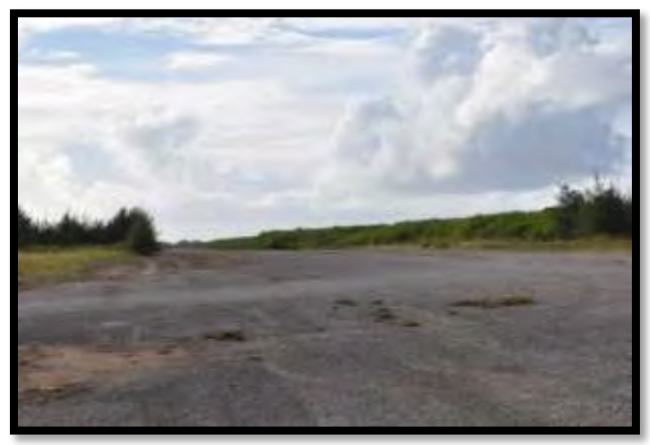
Photo 3.8-1. Historic Runway Able from which Numerous Aircraft Left for Bombing Raids over Japan