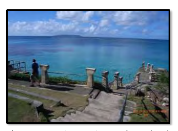
Photo 3.8-17. Unai Taga Stairway to the Beach and Overlook Platform with Aguijan Island in the Distance

Unai Kammer is located on the southwestern side of Tinian facing the Philippine Sea near the village of San Jose. This white sand beach is surrounded by mature vegetation. Unai Kammer contains approximately six well-maintained covered picnic pavilions and a large paved parking lot (Photo 3.8-16). Unai Kammer is utilized by residents as well as tourists, and is one of four beaches recommended by the Tinian Dynasty to visitors (DoN 2014).