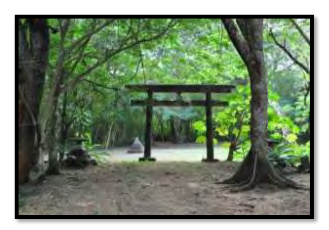
Photo 3.8-8. Nan'yo Kohatsu Kaisha Shinto Shrine off Broadway Avenue