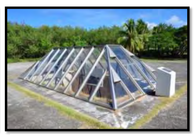
Photo 3.8-2. One of Two Loading Bays from which Atomic Bombs were Loaded into Aircraft for Bombing of Japan