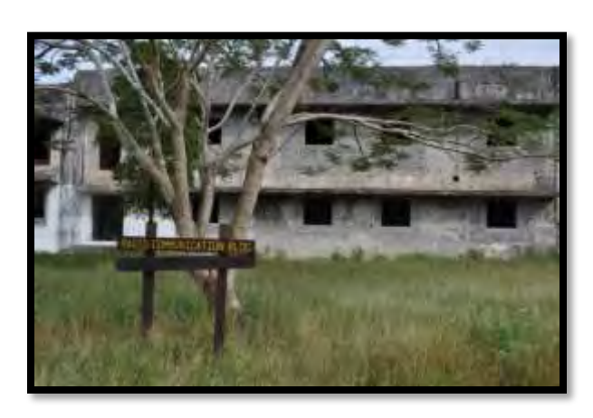
Photo 3.8-7. Japanese Radio Communications Building along Broadway Avenue

Located within the southern portion of the Military Lease Area along Broadway Avenue, the Japanese Radio Communications Building (Photo 3.8-7) is a World War II-era reinforced concrete shell of a two-story building. It is surrounded by smaller accessory facilities. The Tinian Mayor's Office is responsible for maintaining vegetation at the Japanese Radio Communications Building. Just north of the Radio Communications Building is a staging area used for off-road vehicle tours.