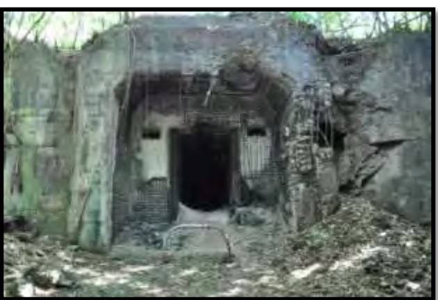
Photo 3.8-6. Remains of Japanese Bomb Storage and Fuel Drum Storage